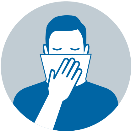
Cover mouth/nose with a tissue or sleeve when coughing or sneezing