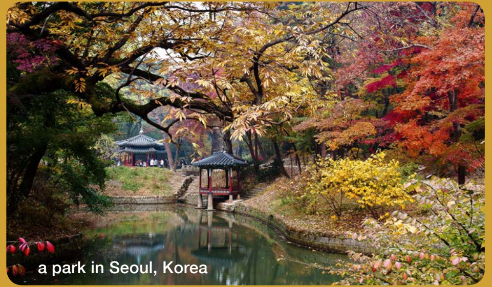
a park in Seoul, Korea

The day before Chuseok , we take a train to my father's village. The train is always crowded with other families leaving the city. Like us, they are happy and excited. We compliment each other's hanbok , which is the traditional dress of Korea. After a few hours, we're there!