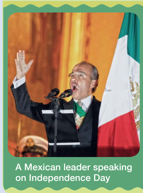
A Mexican leader speaking on Independence Day

gives a speech and then cries, “Mexicanos! Viva México!” The crowds shout back, “Viva México! Viva México! Viva México!” This is the Grito de Dolores , the battle cry of Mexican independence.