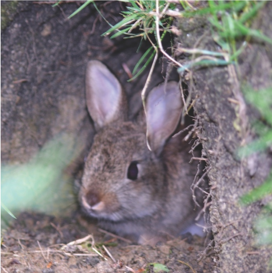
Éste es un hogar para un conejo.