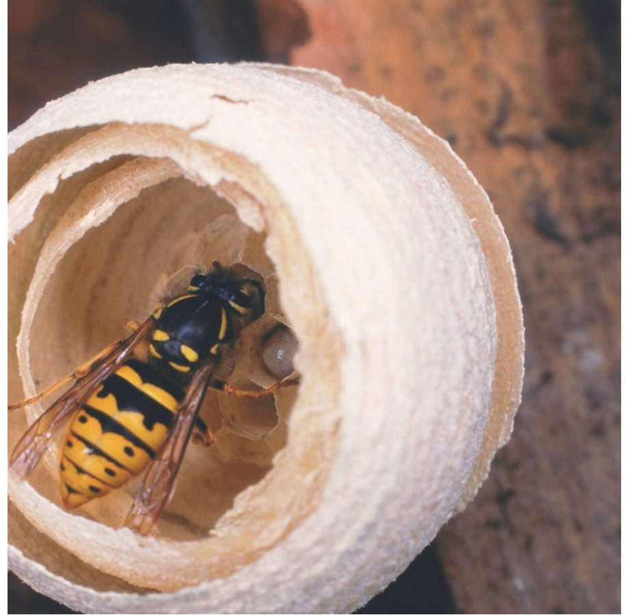
Éste es un hogar para una avispa.