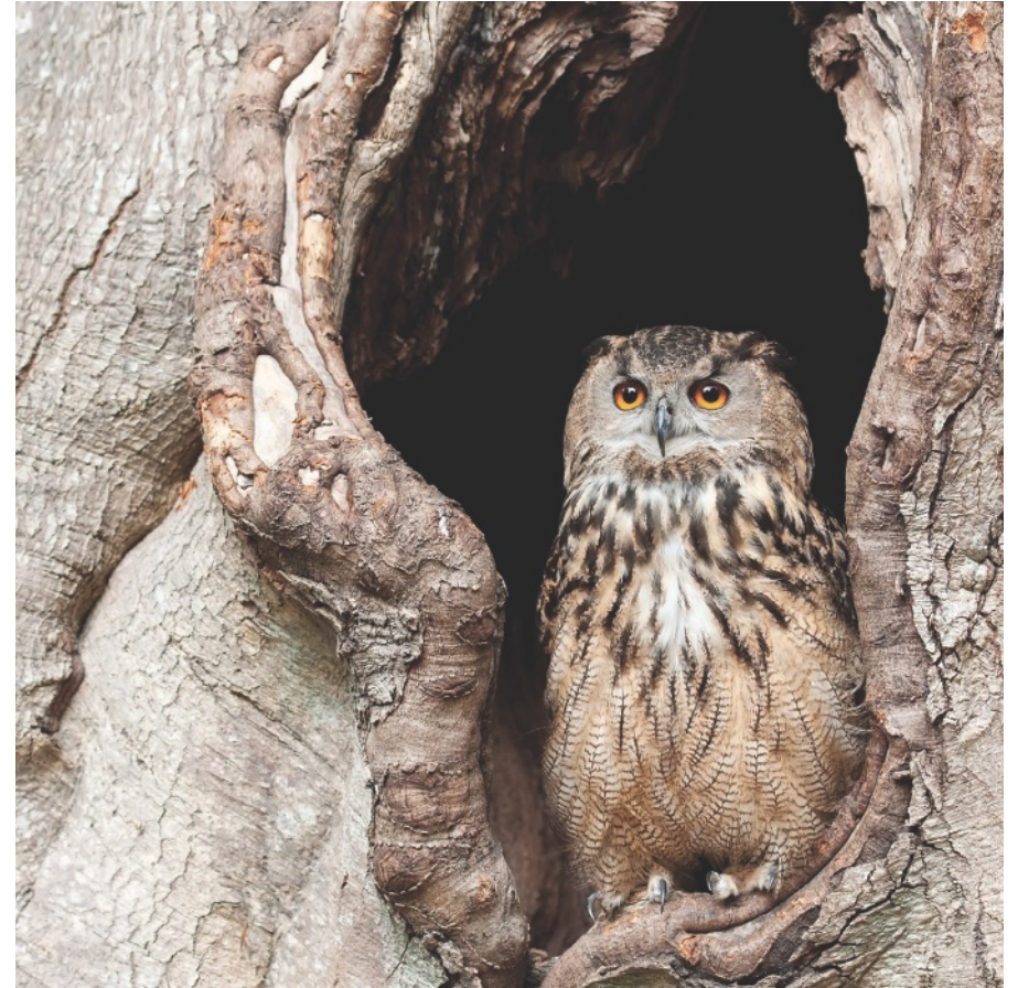
Éste es un hogar para una lechuza.