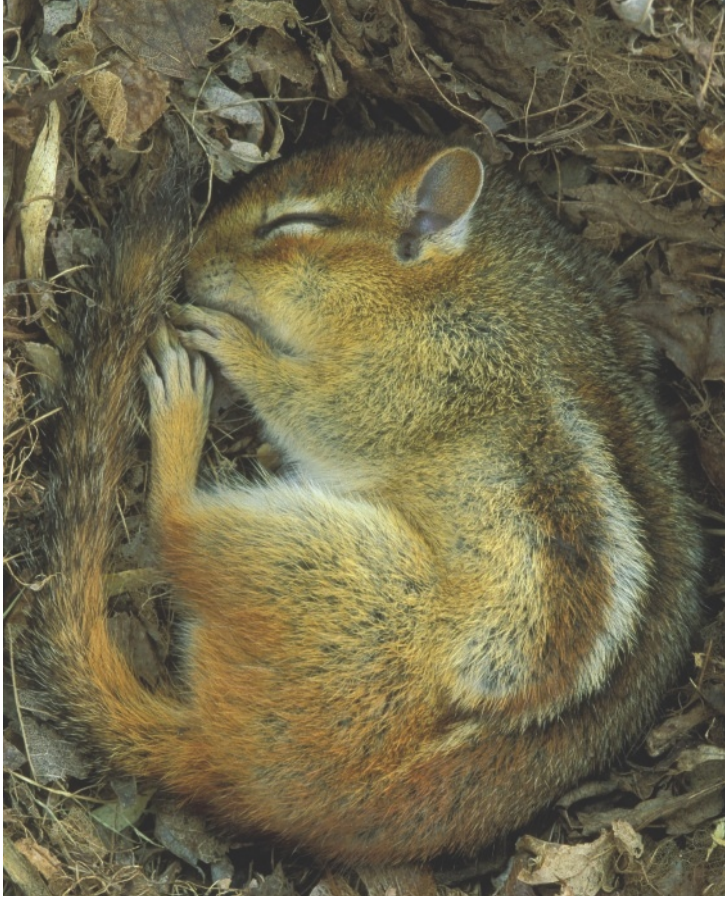
Éste es un hogar para una ardilla.