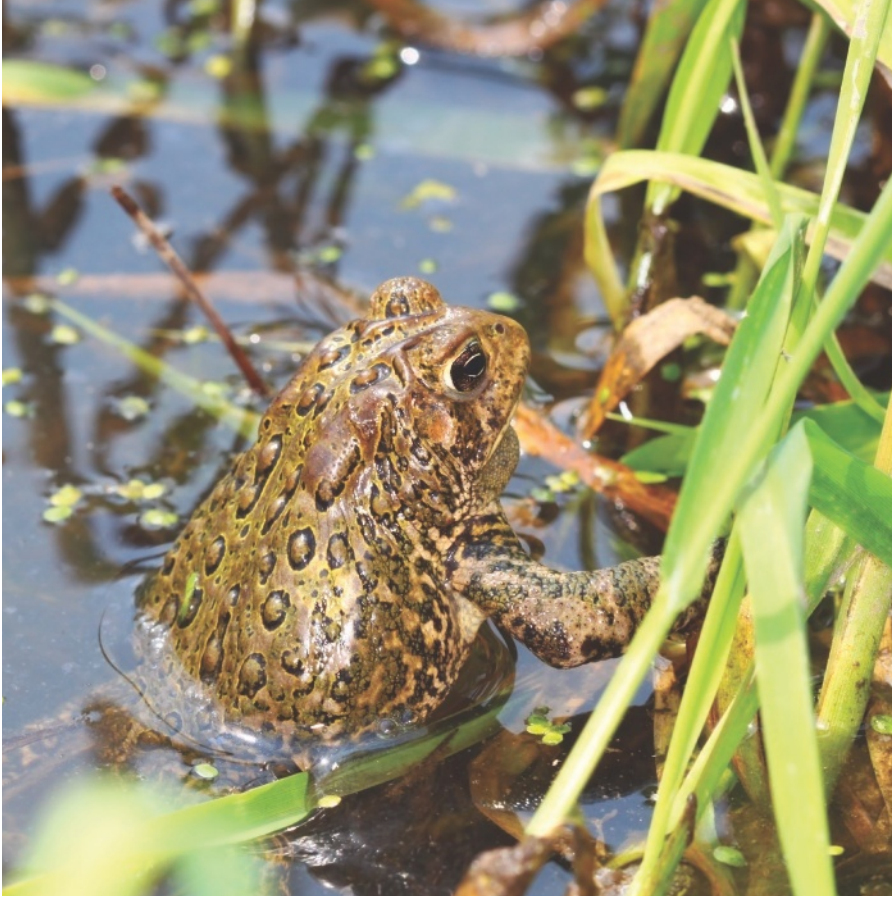
Éste es un hogar para un sapo.