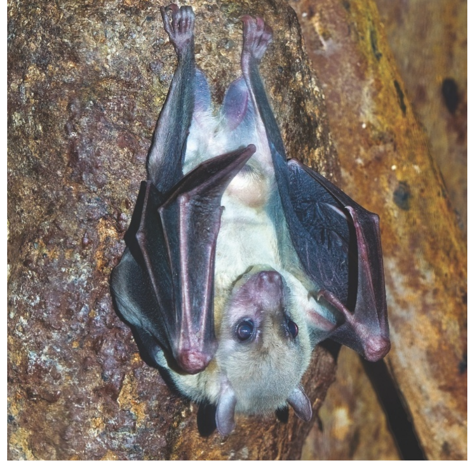
Éste es un hogar para un murciélago.