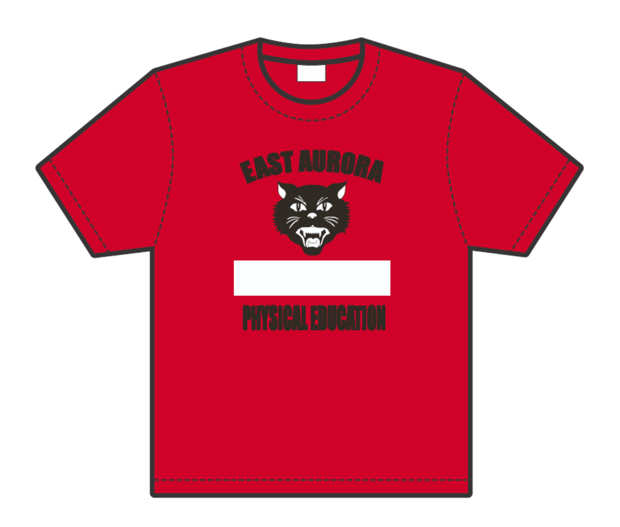
EA LOGO FOR SHIRTS (The District will provide updated artwork upon approval of contract)