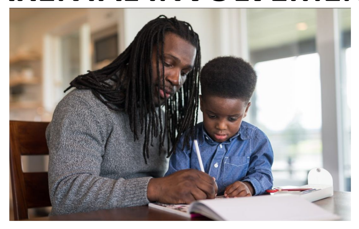
"What gets measured, gets done!"