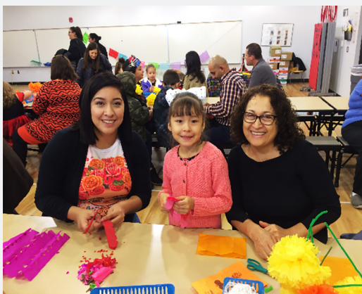
Students gain an appreciation for multiculturalism.