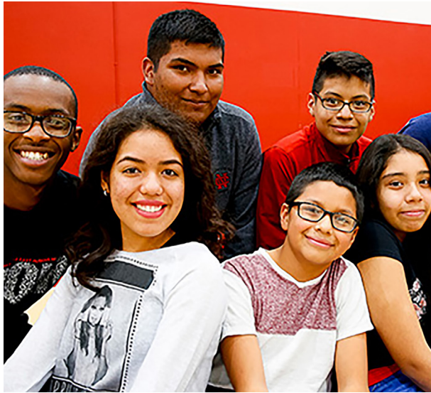
Students become bilingual individuals.