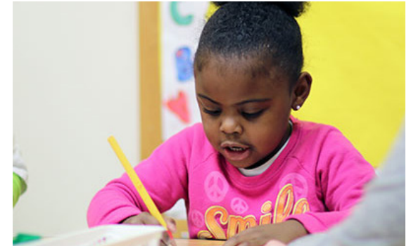
Students will have the ability to listen, speak, read and write in two languages.