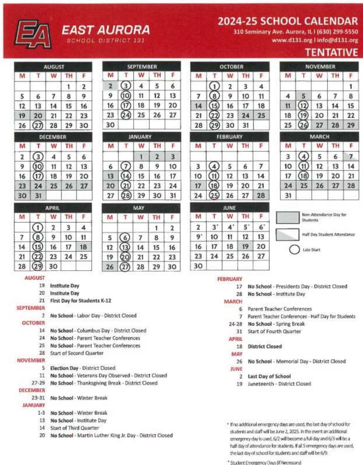
Exhibit I: Projected School District/Operational Calendar