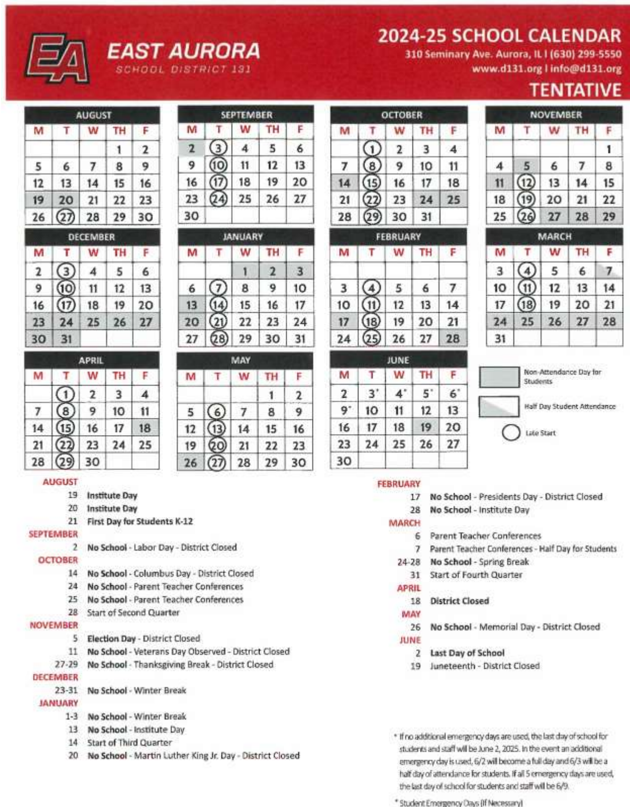
Exhibit I: Projected School District/Operational Calendar